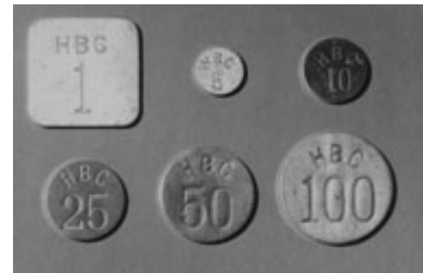
HBC Arctic aluminum tokens in use from 1946 to 1961. HBCA 1987/363-M-39/1

These tokens were round, made of a thick aluminum and came in five denominations: 5, 10, 25, 50 and 100 cents. They measured, respectively; 20 mm, 26 mm, 32mm, 39mm, and 46 mm. The sixth token, the Arctic fox token, was square and stamped with a 1 and measured 46 mm. All tokens had the denomination and HBC stamped on one side while the reverse was blank.