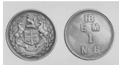
HBC brass Made Beaver tokens HBCA 1987/363-M-39/5

The tokens were made of brass and were stamped with the letters HB (Hudson's Bay Company), EM (East Main District) and MB (Made Beaver) and the denomination. In fact, instead of MB the letters NB were stamped in the coins due to an error on the die-cutter's part. The HBC crest was stamped on the reverse side. In total, four denominations were made: 1MB (30 millimeters), ½ MB (27 mm), ¼ MB (25 mm) and 1/8 MB (19 mm).