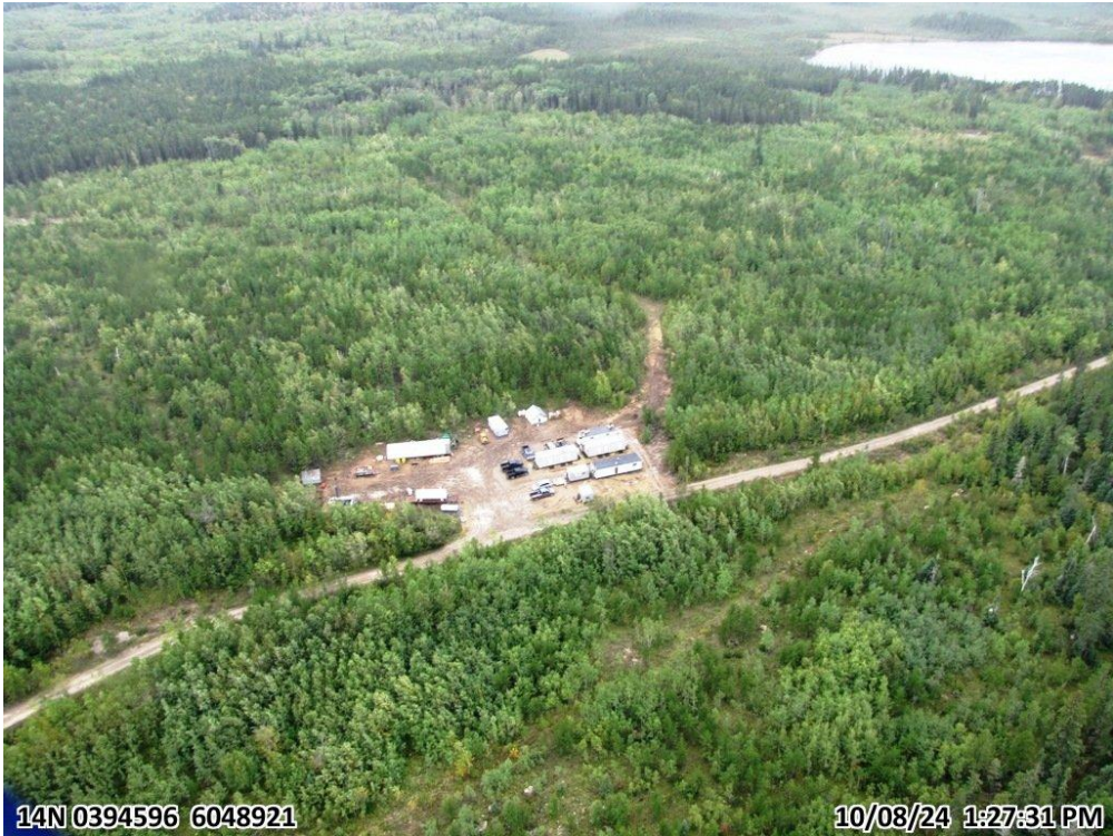
Photo - 13. Temporary Drill Camp with Unnamed Lake 2 in Background (Looking South)↑