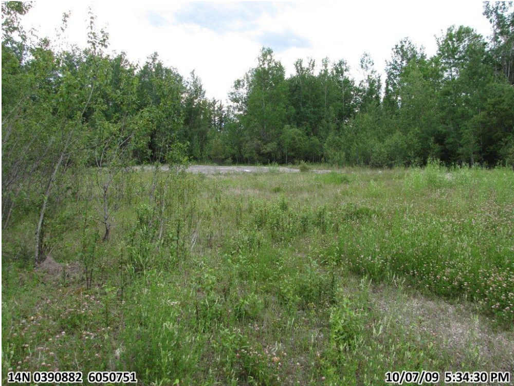
Photo - 11. Asphalt pad from former structure at west end of site ↑