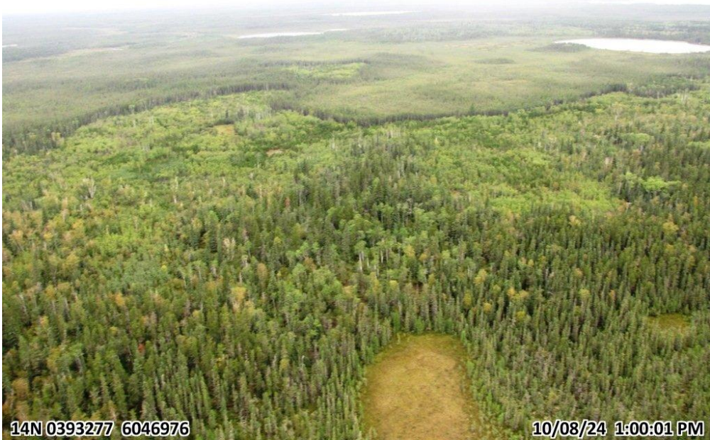
Photo - 12. Clear-Cut Area (foreground) and Mature Mixed Wood Forest Area (background) ↑