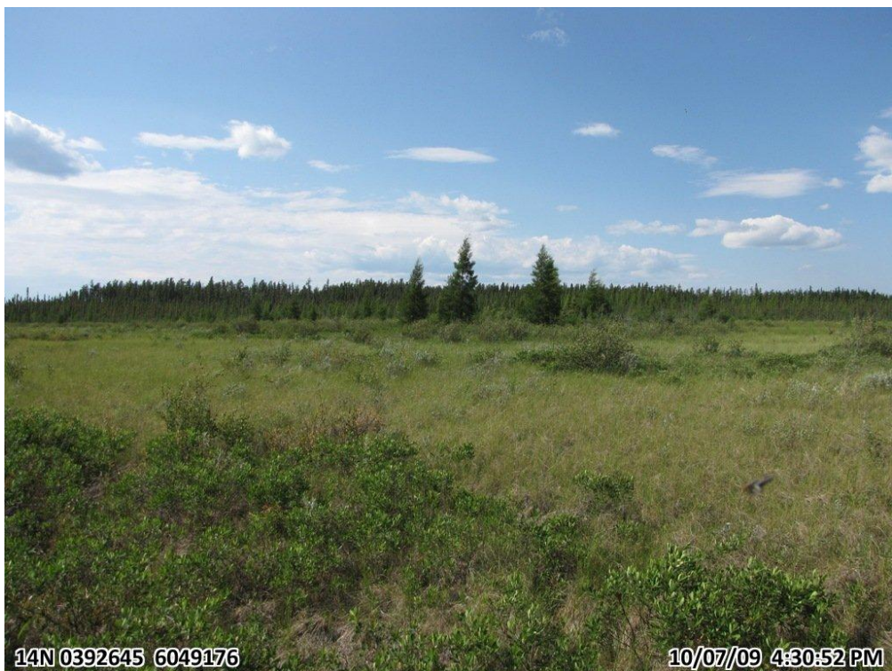
Photo - 08. Wet Fen and Meadow north of Unnamed Lake 2 looking N ↑