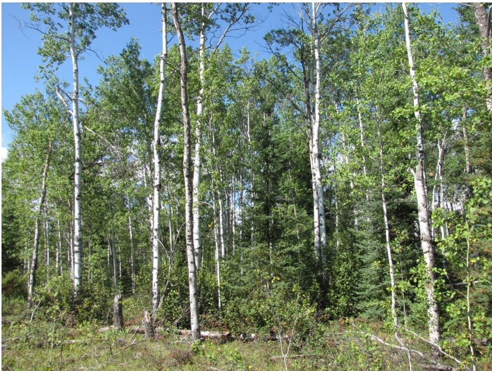
Photo - 02. Mature upland stand in Project area