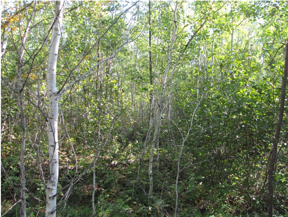
Photo - 01. Old clear-cut area in Project area.