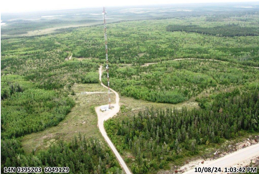
Photo - 10. Communication Tower in Clear-Cut Area (Looking South) ↑