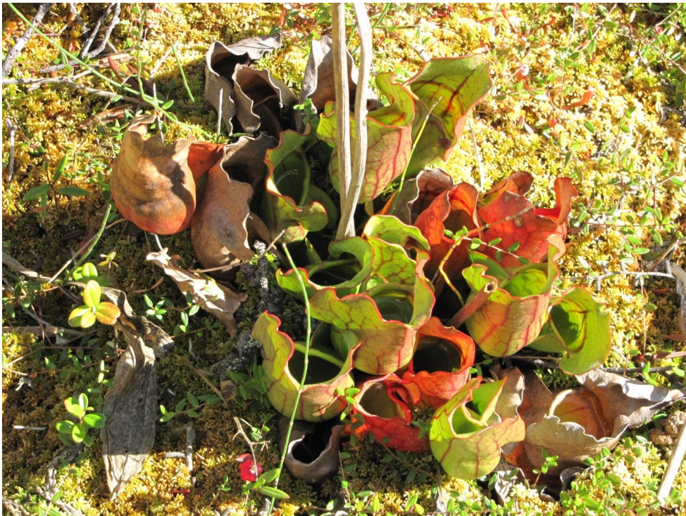
Photo - 04. Pitcher plants in wet fen area