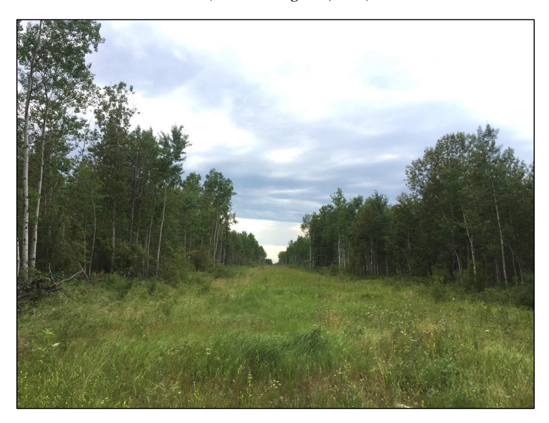
Photo 11: Southeast view of the LSMOC Reach 1 winter road passing through an aspen dominant mixedwood habitat at Plot 18 (taken on August 3, 2016)