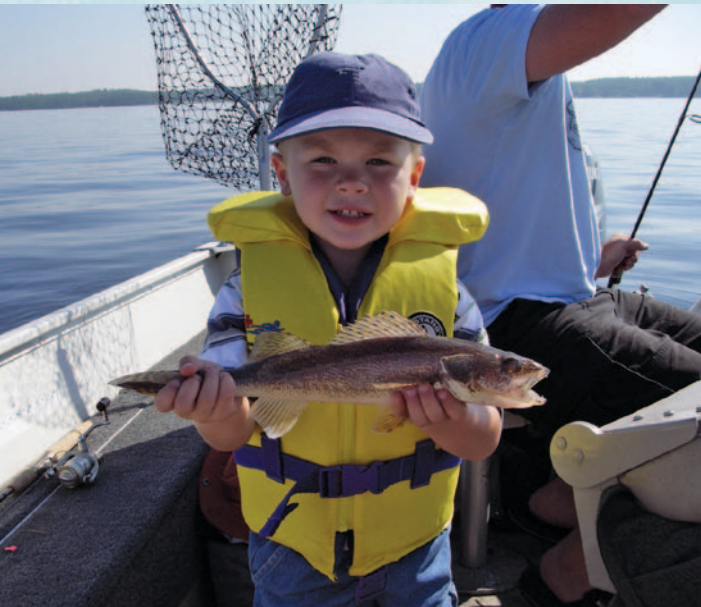
Education and outreach projects emphasize the importance of fisheries resources in Manitoba. Youth angling programs across the province offer fishing activities and encourage stewardship.

The stamp is also a reminder to anglers that portions of their licence fees help fund projects that ensure adequate fish stocks exist for future generations.