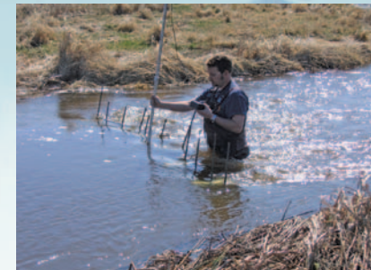
Measuring water velocity is part of assessing river and watershed habitat. Watershed and habitat assessments result in site-specific enhancement of: riparian areas through fencing and off stream watering sources.

If your group or organization has a project in mind, fisheries staff can offer advice and technical expertise to help you develop a proposal.