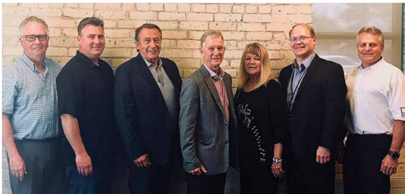
The Apprenticeship and Certification Board

Apprenticeship Manitoba provides the necessary technical and administrative support to the Board, its committees and the PACs. The Executive Director of Apprenticeship Manitoba is the Secretary and Ex-Officio Member to the Board, and is the main contact for interprovincial and pan-Canadian apprenticeship Initiatives. The Executive Director also represents Manitoba at the Canadian Council of Directors of Apprenticeship (CCDA).