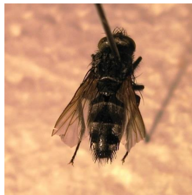
Figure 8. Athrycia cineria

Predators of bertha armyworms have not been well studied. Vertebrate predators, particularly birds, may be important during periods of high populations of larvae.