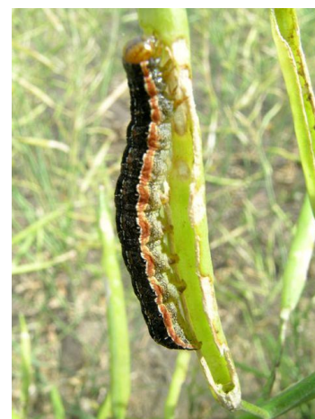
Figure 1. Bertha armyworm larva

Infestations may be localized or spread over large areas. Crop losses can be minimized if high populations are detected early.