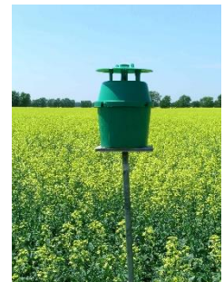
Figure 6. Trap for monitoring adults of bertha armyworm

To help forecast potential levels of larvae, moths of bertha armyworm can be monitored in June and July using traps baited with sex pheromone lures, which attracts the male moths. The number of moths collected by these traps gives an indication of what the bertha armyworm larval populations may be like regionally, although they may not be an accurate predictor of larval numbers for the field the trap is in. These traps are best used in a coordinated regional forecasting program rather than a field-specific predictor.