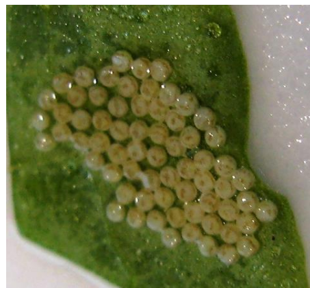
Figure 3. Cluster of eggs of bertha armyworm

Larvae are the only development stage of the bertha armyworm to cause crop damage. They feed on a variety of crops and weeds. Canola, rapeseed, mustard, lamb's quarters and related plants are preferred host plants. They can also cause significant damage to quinoa and hemp. Bertha may also feed on a range of other plants including flax, potatoes, alfalfa, and peas.