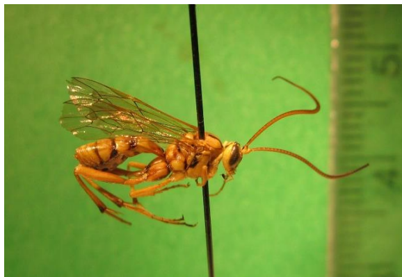
Figure 7. Banchus flavescens

Parasitic insects that can kill bertha armyworm include an ichneumonid wasp ( Banchus flavescens ), and a tachinid fly ( Athrycia cinerea ). When levels of these parasitoids are numerous, parasitism by Banchus flavescens can exceed 40%, and Athrycia cineria may kill over 20% of bertha armyworms. Banchus flavescens attacks the early larval stages (1 to 3) of bertha armyworm, while Athrycia cineria attacks later stages (3-6).