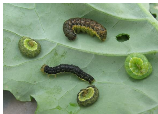
Figure 4. Mature larvae of bertha armyworm can vary in colour