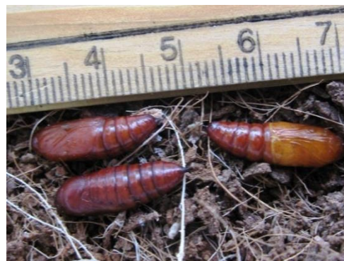
Figure 5. Bertha armyworm pupae