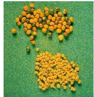
Figure 3. Canola seeds (top) and wheat midge cocoons (bottom).