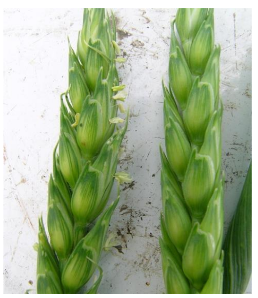
Figure 5. Wheat heads with anthers (left) and without (right).

Inspect the field in at least three or four locations. Midge densities and plant growth stages at the edge and centre of fields may be very different. The highest densities are often next to fields where wheat was grown in previous years or in low spots where soil moisture is favourable to midge development.