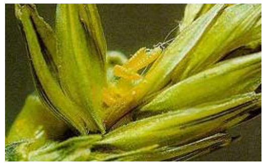
Figure 2. Wheat midge larvae feeding on developing wheat kernel.

In contrast, the midge is not active during the day. Wheat midge tends to flutter from plant to plant and assumes a vertical position with its head pointed skyward when resting on the plants.