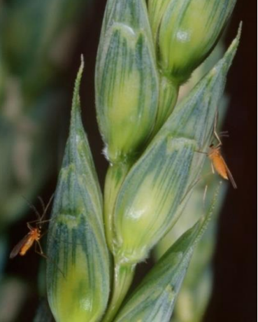
Figure 1. Adult wheat midge.

Adult midge emerge from the pupal stage in late June or early July. During the day, adults remain within the crop canopy where conditions are humid. In the evening, females become active at the top of the wheat canopy, laying their eggs on the newly emerged heads of wheat. Female midge live for less than seven days and deposit an average of 80 eggs.