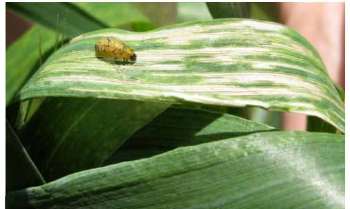
Cereal leaf beetle feeding and larva. Note that larvae are sometimes coated in a fecal coating and may appear dark or like dirt on the leaf.

Cereal leaf beetle: I am looking for samples of cereal leaf beetle larvae this growing season to determine their range across Manitoba, their population density, and the rate at which larvae are parasitized. Please contact John Gavloski at the contact information below should you have cereal leaf beetles feeding in any of your cereal fields. I am particularly interested in what levels are like and percent parasitism in the eastern regions of Manitoba.