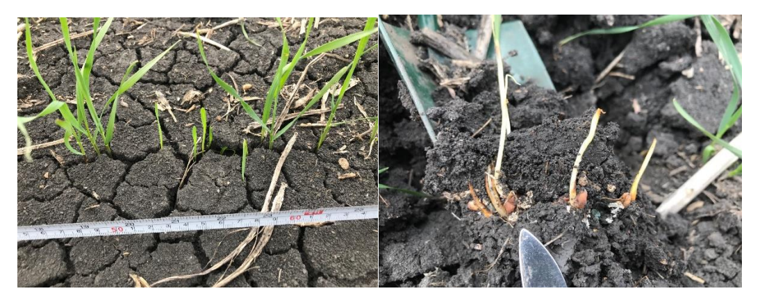
Additional pictures and symptoms are shown in:

The symptoms of injury vary from late emerging crop to stunted or dead seedlings below ground. Dissolved fertilizer granules are also evident in proximity to the seed.