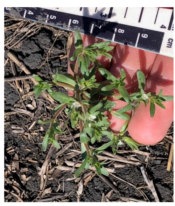
Purslane speedwell – Picture submitted by Derek Janzen at Rosenort Agro.

Purslane speedwell is sometimes misidentified initially as cleavers – but looking at the opposite leaves that eventually become alternate leaves, round stem and small white flowers, this is not the clingy cleavers with a square stem and whorl of leaves. This weed is not easily controlled with phenoxy herbicides, and seems to be cropping up more frequently this year. There is more info in an archived CropChatter article found here: <a href="http://cropchatter.com/what-is-purslane-speedwell-and-how-do-i-control-it/">http://cropchatter.com/what-is-purslane-speedwell-and-how-do-i-control-it/</a>