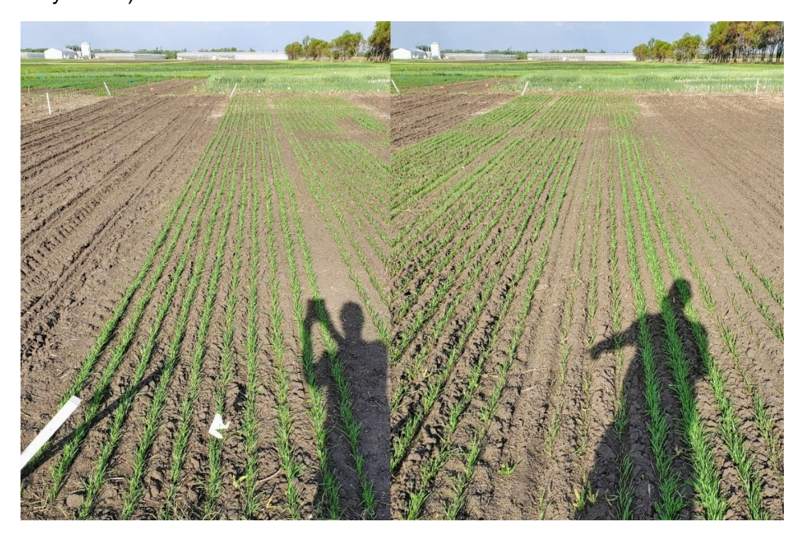
1 Ideal stand after depth adjustment (left)) vs. Variable stand prior to depth adjustment (right).

When evapotranspiration is high and the soil surface is drying out rapidly, it can be difficult to get depth placement just right. Seeds need to be in moist soil with good seed-to-soil contact. For most of the crops in the Disease section, we've been seeding with a double-disc press drill with on-row packing. Partway through seeding our wheat, we were checking the depth across the implement and finding that, behind the tractor wheels (outside 3 rows on either side), the wheat was too shallow and not getting into moisture. A depth adjustment was made and, for the remaining two passes, things were ideal. Now that the crop has emerged the stand reflects that many seeds were stranded in dry soil and did not germinate until there was significant rainfall (20mm on May 23-24).