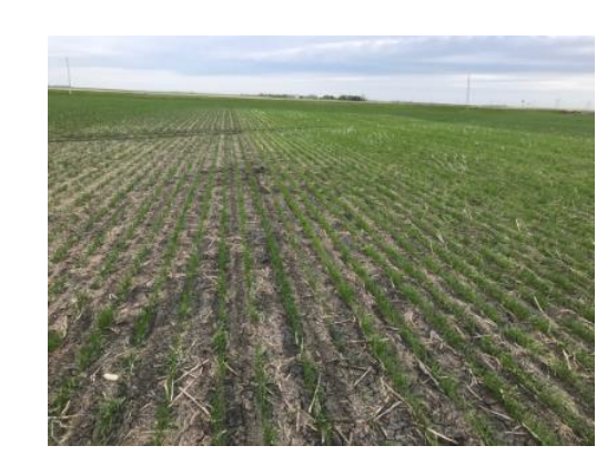
Figure at right: Full stand of check "stamp" on right suffering nutrient deficiency vs the nourished, but 45% stand to left with seedplaced fertilizer.

Stand scouting may reveal thin stands of cereals – especially if you have installed a "check stamp" area without seedplaced fertilizer for comparison.