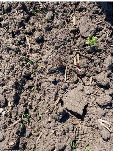
Crop damage is likely due to the same factor that is causing such great weed control – likely a herbicide carryover issue!