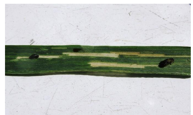
The larvae often have fecal shields on their backs (as shown on the photo on the right), and are small (about 4-5 mm when fully grown). They can easily be confused for dirt or debris on the leaves.