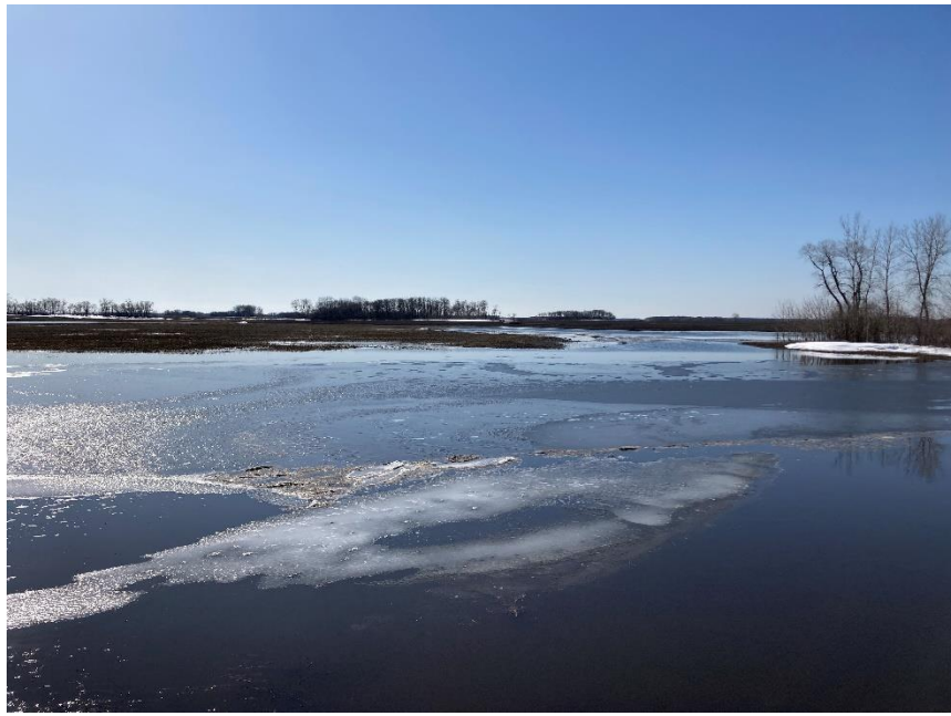
Figure 1. Early spring flooding on Manitoba farmland

Spring flooding may cause large losses of fall-applied nitrogen (N) fertilizer and residual nitrogen left over after the previous crop or fallow year (Figure 1). The following topics deal with losses of residual soil N, fall-applied N fertilizer, other nutrients, and how to determine the extent of N loss.