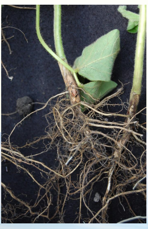
Figure 2. Soybean roots devoid of nodules.

2. Soybean roots in the plot area did not develop nodules (Figure 2.), however plants did not appear pale in colour or nitrogen deficient (Figure 3). Tissue N levels at early flowering (July 18) rated sufficient (5.27% N). Soil organic matter levels were high at 4.3%.