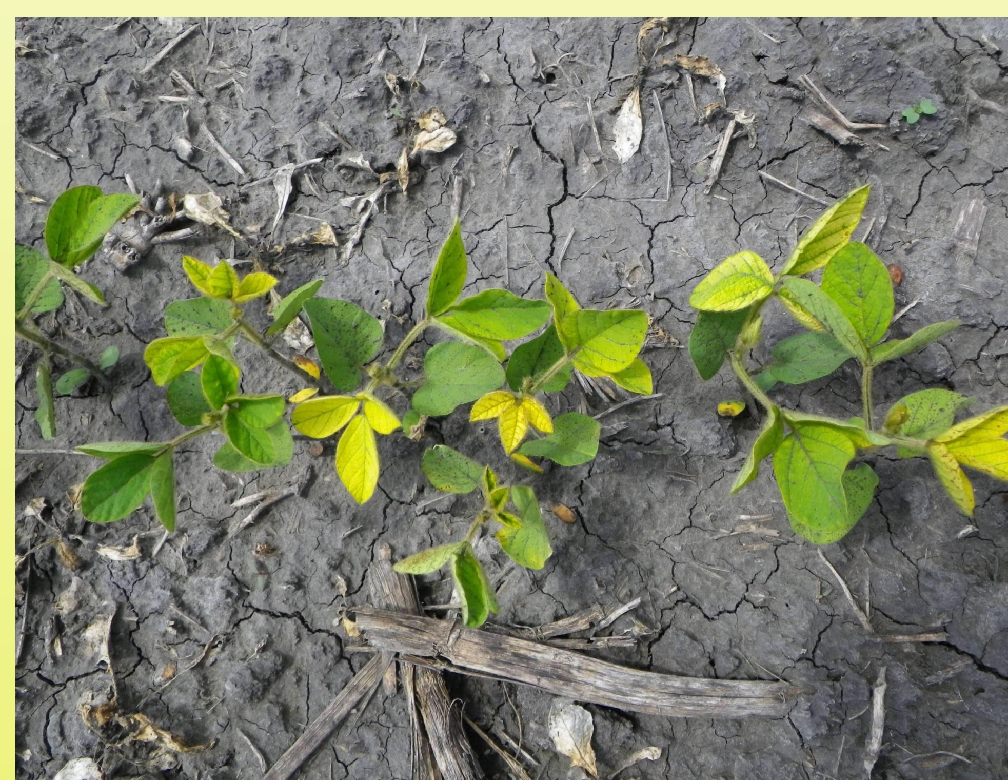
Figure 1. Iron deficiency chlorosis (IDC) in portion of field fertilized following emergence.

1. In June, severe iron deficiency chlorosis (IDC) was observed only in the areas receiving 100 lb N/ac at emergence. (Figure 1).