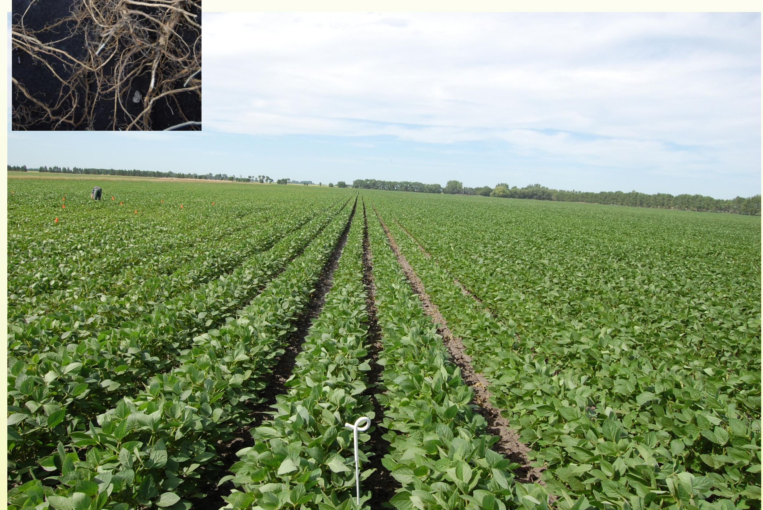
Figure 3. Non-nodulated soybean field on July 18. Area to right of white stake has the 100 lb N/ac rate applied on

Figure 2. Soybean roots devoid of nodules.