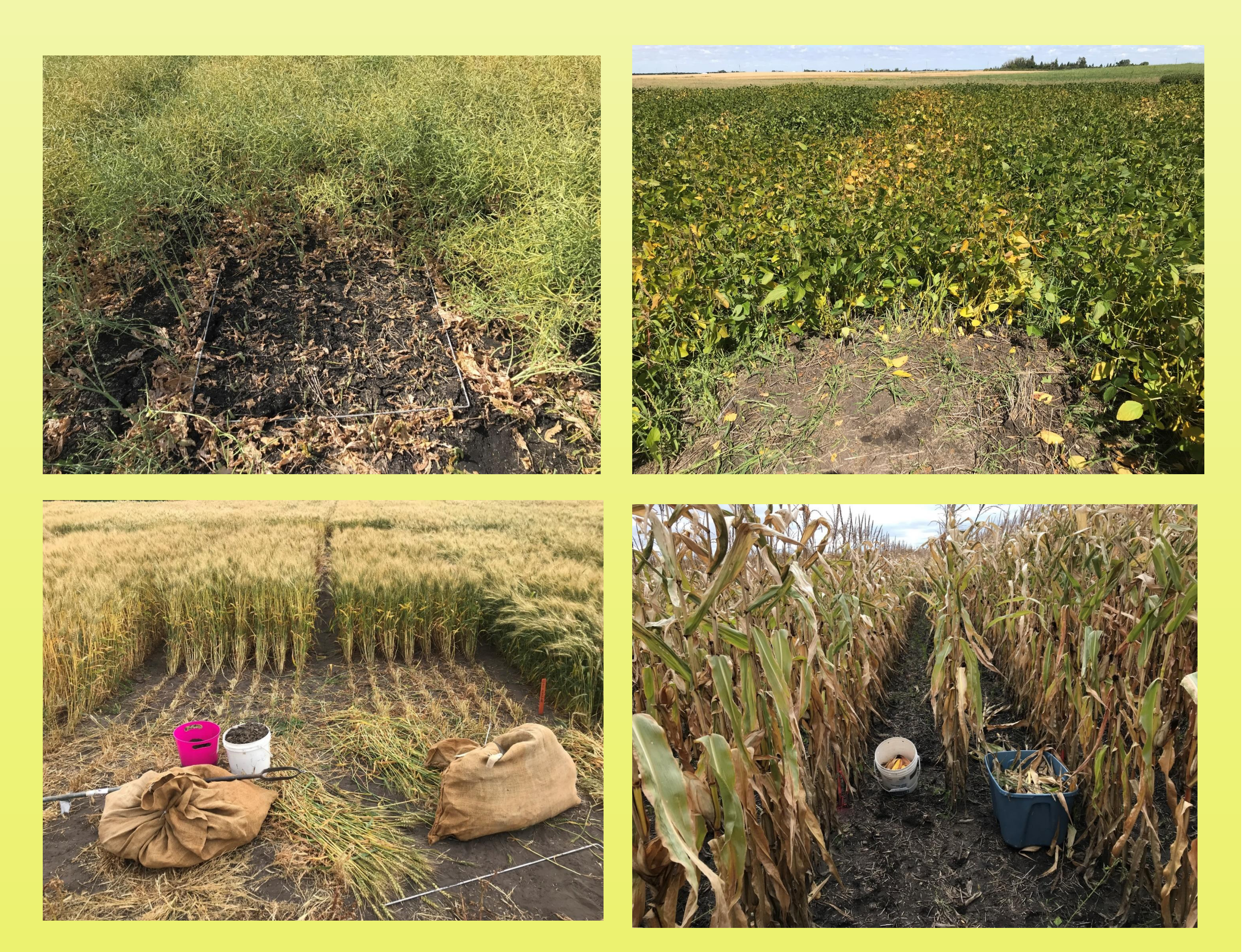
Table 1. Whole plant biomass sampling to determine crop nutrient uptake.