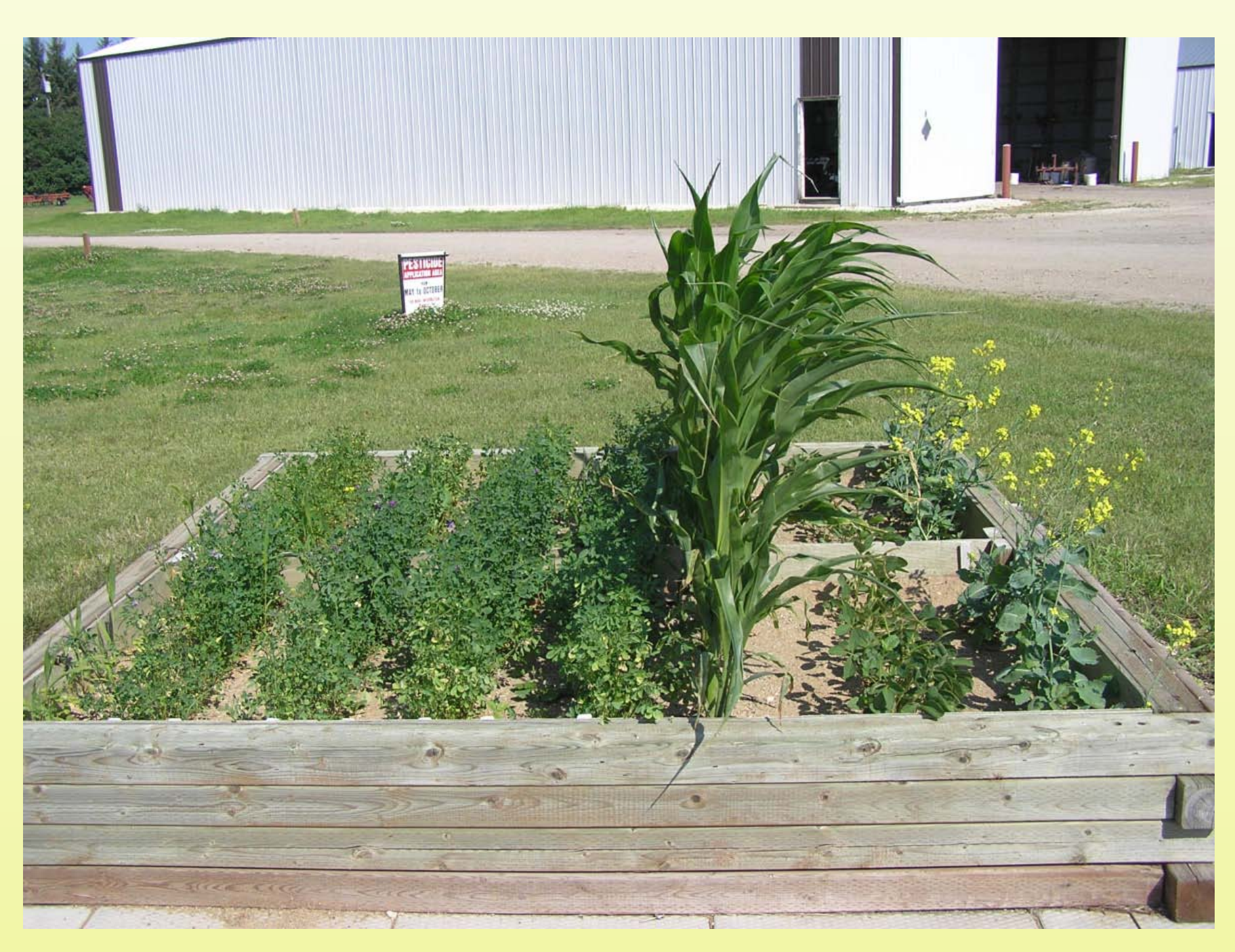
Figure 1. Sand box for demonstrating macronutrient deficiencies.

Four large sand boxes (2.4 m x 2.4m) were built on concrete slabs, lined with landscape fabric and filled with coarse, low organic matter, low fertility sand soil.