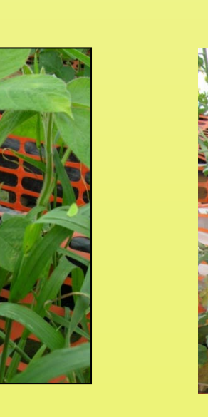
Figure 3. Observed symptoms.

Field agronomists ( Figure 4 ) rated the value of the lesson 4.4/5 for quality of information learned. Visual symptoms were considered a starting place for diagnosis to be confirmed with soil and tissue analysis.