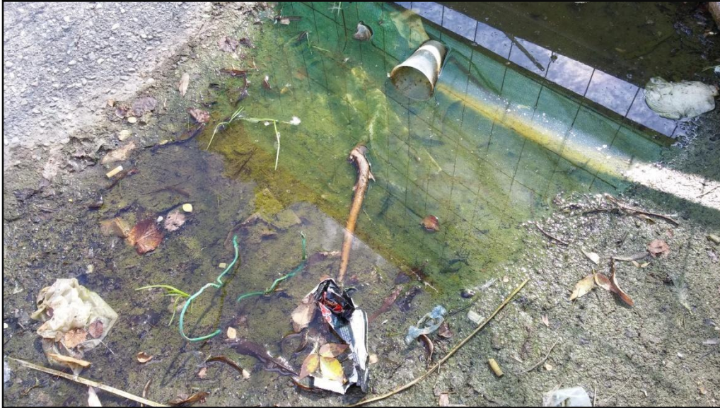
Figure 2: Industrial Mosquito Habitats. This urban parking lot next to a construction site was unable to drain for weeks resulting in the growth of cattails and mosquito larvae.

Landscape management can play a role in reducing adult mosquito populations as well. Adult mosquitoes require a shady and humid place to rest in order to prevent drying out during the heat of the day. Residents and businesses can keep their lawns cut short and the foliage on their trees and shrubs pruned to allow more breeze. This is especially important for shrubs or trees near walkways and entrances in which mosquitoes can be disturbed by people walking by. Reducing the number of potential resting sites can reduce the numbers of biting mosquitoes around homes and businesses and thus lower the risk of WNV transmission.