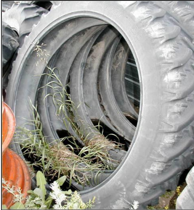
Figure 1: Tires fill with water and organic debris and become ideal mosquito breeding habitats.

Source reduction focuses on removing or regularly emptying containers, or other management techniques to reduce the number of potential larval mosquito development sites. Communities and RMs can encourage their residents to reduce the number of containers in their yards through educational campaigns (newspaper, radio, newsletters), by having a “free garbage drop-off day”, by supporting cleanup activities such as Earth Day or by organizing one with local Scout or 4H groups. One community shared that the “Communities-In-Bloom” program promoting beautification of the community has significantly contributed to residents removing unsightly items (such as old paint cans, tires) from their yards. This had the dual benefit of beautification and reducing of potential mosquito habitats.