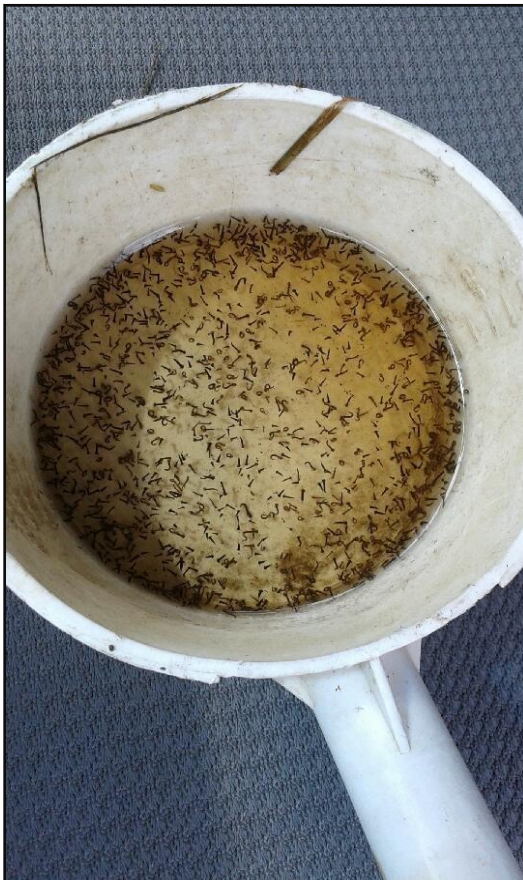
Figure 7: High Density of Mosquito Larvae.

Applicators can estimate the larval density by taking 10 evenly-spaced dips per water body. If the average number of larvae is low (1 - 4 in 10 dips), it may not be worth treating, especially if the water body is large. Again, the goal of an IPM is not to eradicate the entire pest species, but to use treatments only when they have actual benefits. Densities greater than 5 larvae per 10 dips are generally worth treating especially if the water body is small (a larval sampling guideline is included in Appendix A ). In the figure ( Figure 7 ) below, more than 100 larvae were collected in a single dip, showing how a small site can produce a significant number of mosquitoes.