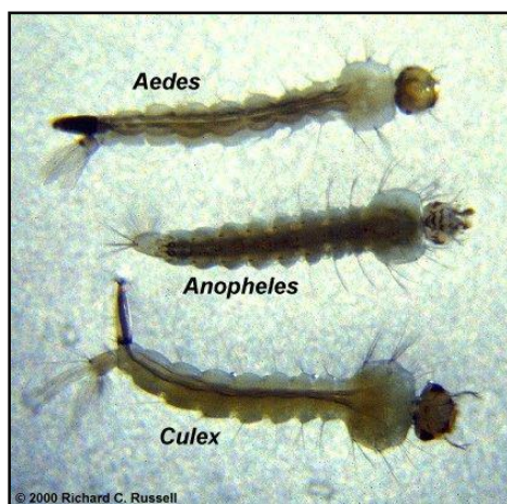
Figure 4: Various mosquito larvae. Note that Culex larvae have an elongated siphon and a large triangular shaped head.

Applicators can be trained to identify Culex larvae on site using a simple hand-held field microscope (or magnifier) and a mosquito larval identification key in the field (Figure 4). This can help applicators become more familiar with Culex mosquito egg-laying habitats in their control area and become more proficient at finding additional sites. An excellent source for larval identification is “ The Insects and Arachnids of Canada Part 6: The Mosquitoes of Canada ” by Wood, Dang and Ellis and published by Agriculture Canada.