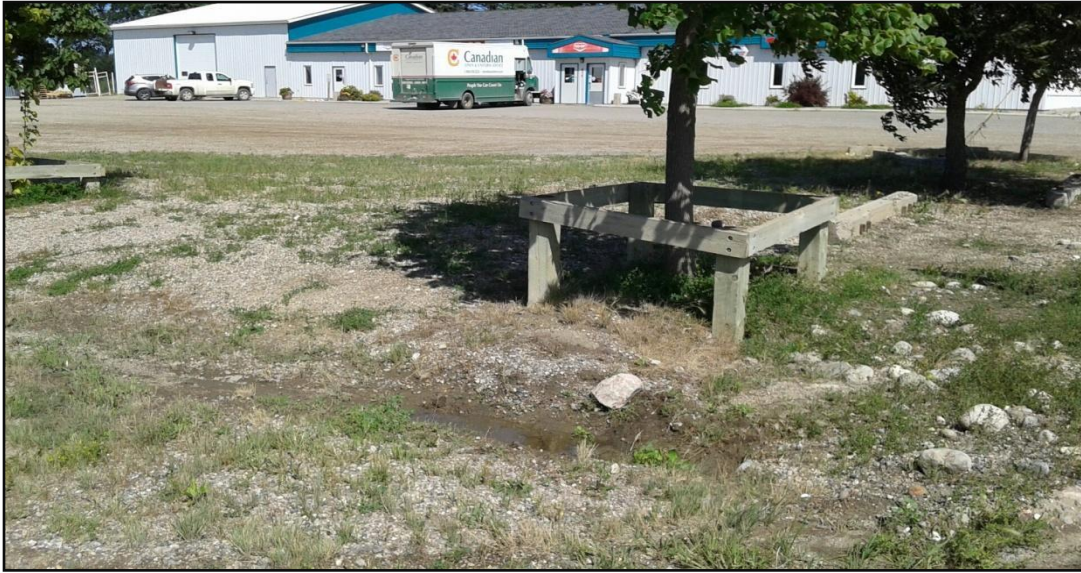
Figure 3: Source Reduction. This small rut can easily be filled in with soil and will cease to be a potential mosquito laying site. Please note that any major changes to drainage (i.e. digging deeper ditches, lowering of culverts, wetland drainage) need to be reviewed by ECP.