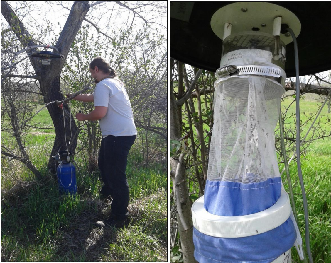
Figure 5 & 6: CDC Trap with Carbon dioxide bait being set up for WNV surveillance (left), and collected adult mosquitoes (right).