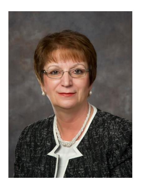
Eileen Clarke Minister Indigenous and Northern Relations