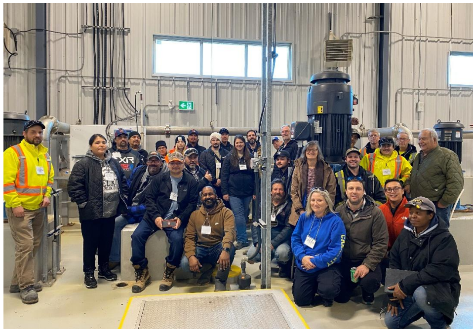
Northern Affairs Public Works Employees and Northern Affairs staff at the Landmark Water Treatment Plant, RM of Tache

From November 4–6, 2025, Northern Affairs Branch, hosted the 2025 Public Works Employee (PWE) Workshop. Held over three days, the workshop brought together public works employees, community representatives, and technical experts to build capacity, share knowledge, and strengthen infrastructure management across Northern Affairs communities.