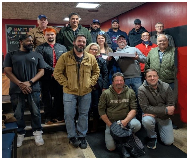
Bowling at Westwood Lanes

Day 3: Safety and Equipment Training: the final day was a half day, the sessions focused on chainsaw safety, an essential skill for northern public works teams managing seasonal hazards and emergency response.