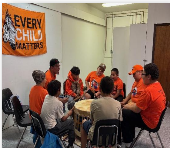
Turning Point Jrs. from Skownan First Nation Youth Drum Group

The evening opened with a warm welcome from the mayor, followed by a delicious catered meal. Attendees received complimentary merchandise, including t-shirts and *Every Child Matters* memorabilia. A local resident then offered a moving performance—singing and playing her hand drum which set a reflective tone for the night.