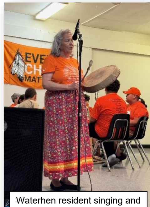
Waterhen resident singing and playing the hand drum

Orange Shirt Day, observed annually across Canada, honours Indigenous children who were sent to residential schools. It is a time for reflection, learning, and a shared commitment to truth and reconciliation. This event sought to raise awareness, honour survivors, acknowledge the legacy of residential schools, and create space for the community to come together in meaningful commemoration.