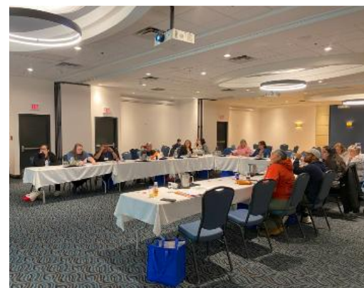
CAOs engaged in various team-building activities at the workshop