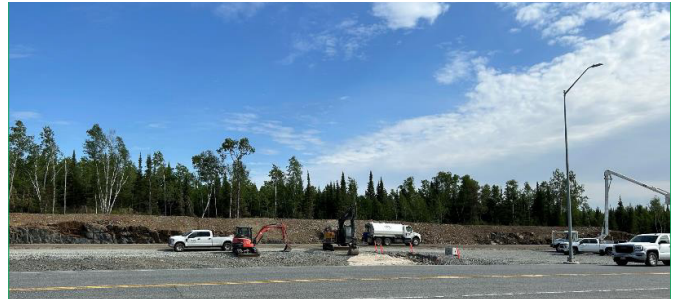
Figure 1: PTH 1 four-laning on the Ontario side.

Manitoba Transportation and Infrastructure (MTI) has also started construction on a short extension (700m) of the divided four-lane section of PTH 1 from the weigh-scale east of West Hawk Lake to the Manitoba/Ontario boundary.