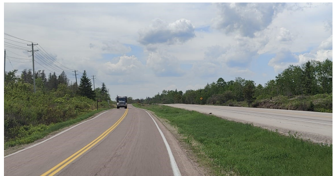
Figure 3: View of PTH 1 and PR 301 (looking east)

Please watch your local newspaper, MTI's website , and EngageMB for current and future project and meeting announcements.