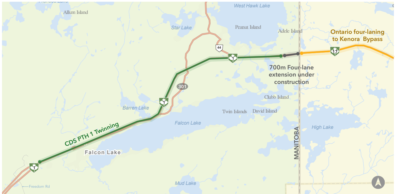
Figure 2: Study Area - PTH 1 from 5.0km west of PR 301 to Ontario Boundary