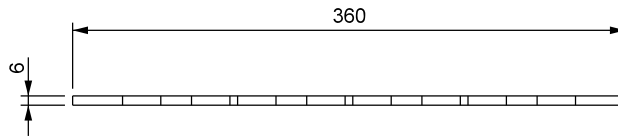
ELEVATION VIEW 1:5