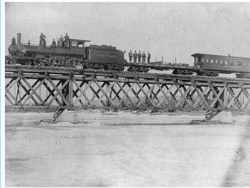
Engine # 1 – 1913