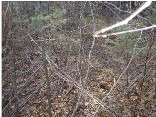
Photograph 18 ↑ RB08: Dry stream bed on the north side of the rail bed