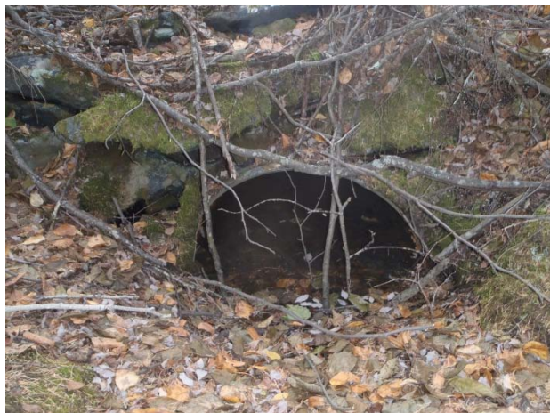
Photograph 19 ↑ RB08: Culvert on the south side of the rail bed