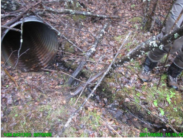
Photograph 09 ↑

RB05: Culvert on the north side of the rail bed