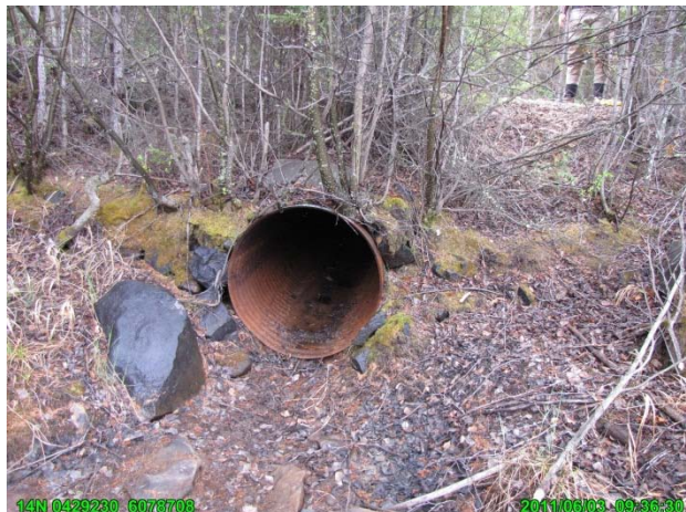
Photograph 01 ↑

RB01: Culvert on the north side of the rail bed