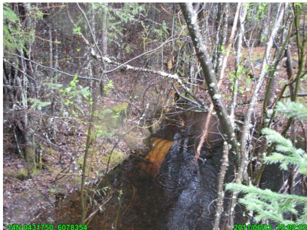
Photograph 13 ↑

RB06: Submerged culvert on the north side of the rail bed