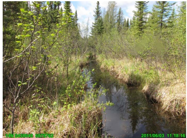
Photograph 08 ↑

RB04: Overgrown culvert on the south side of the rail bed