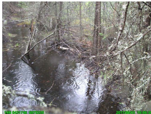
Photograph 16 ↑

RB06: Submerged culvert on the south side of the rail bed