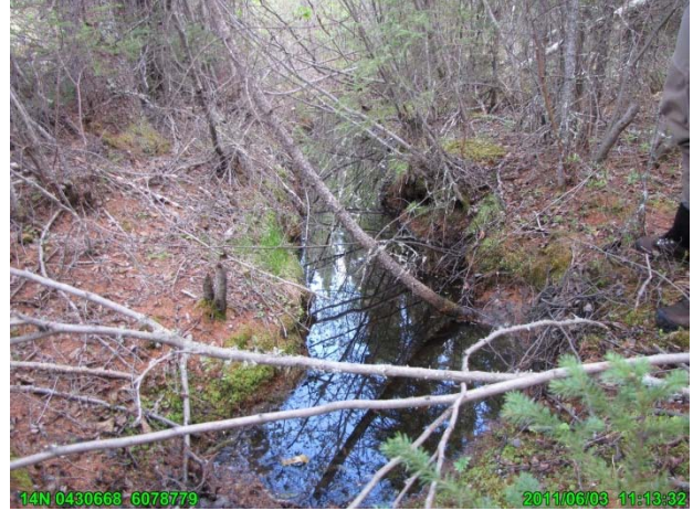
Photograph 06 ↑

RB04: Overgrown culvert on the north side of the rail bed