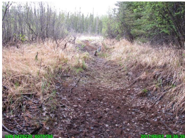
Photograph 02 ↑

RB01: Culvert on the north side of the rail bed