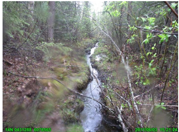
Photograph 12 ↑

RB05: Culvert on the south side of the rail bed