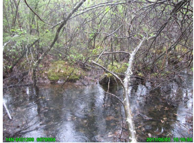
Photograph 10 ↑

RB05: Culvert on the north side of the rail bed