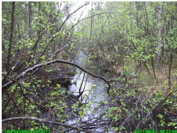
Photograph 22 ↑

RB09: Overgrown culvert on the north side of the rail bed