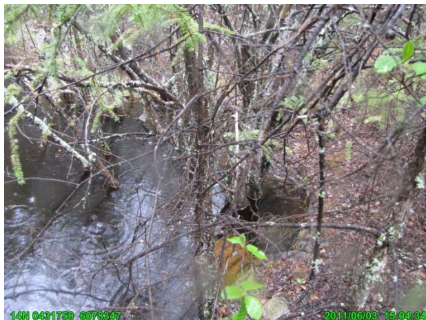
Photograph 15 ↑

RB06: Standing water on the north side of the rail bed