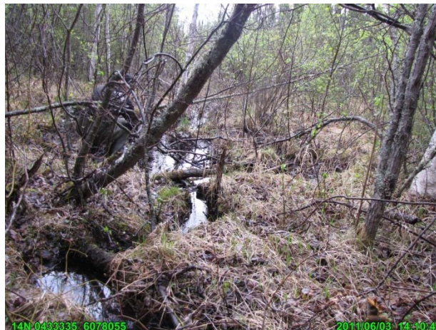
Photograph 26 ↑

RB10: Overgrown culvert on the north side of the rail bed