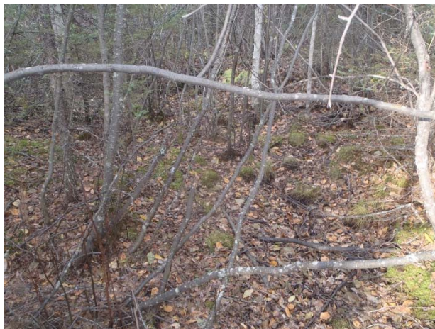
Photograph 20 ↑ RB08: Dry stream bed on the south side of the rail bed