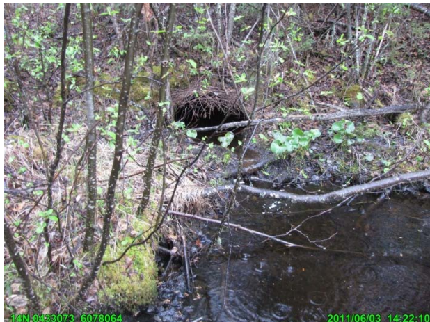
Photograph 21 ↑

RB09: Overgrown culvert on the north side of the rail bed