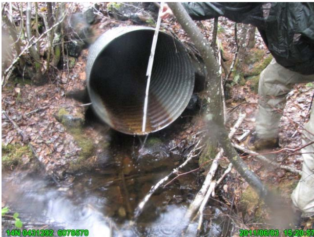
Photograph 11 ↑

RB05: Stream on the north side of the rail bed