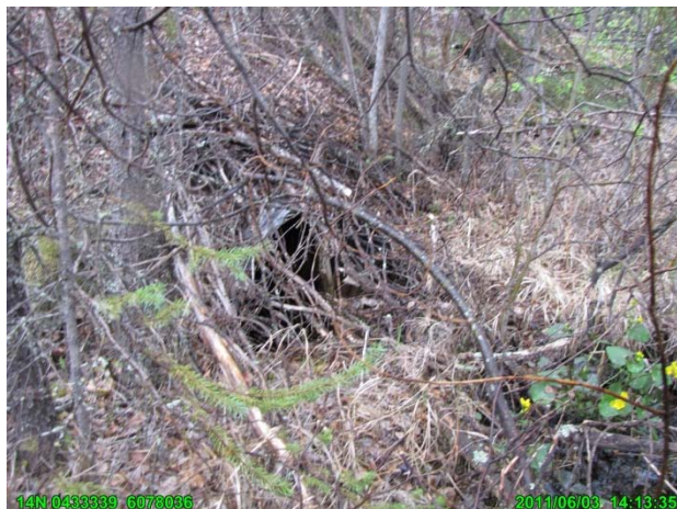
Photograph 27 ↑

RB10: Stream on the north side of the rail bed