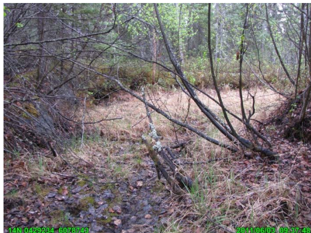
Photograph 04 ↑

RB01: Culvert on the south side of the rail bed