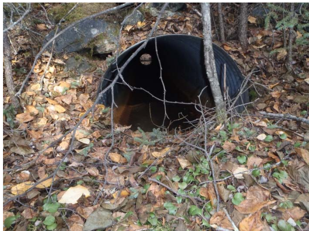
Photograph 17 ↑ RB08: Culvert on the north side of the rail bed