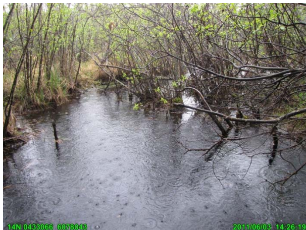
Photograph 24 ↑

RB09: Overgrown culvert on the south side of the rail bed