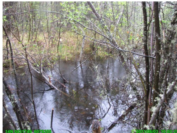
Photograph 14 ↑

RB06: Submerged culvert on the north side of the rail bed