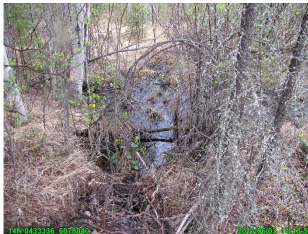
Photograph 28 ↑

RB10: Overgrown culvert on the south side of the rail bed