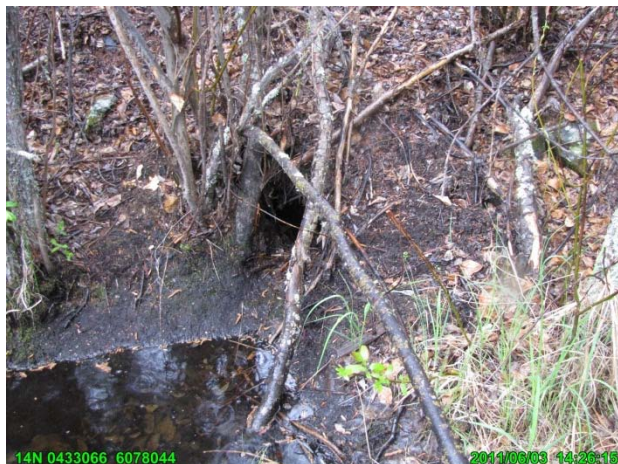
Photograph 23 ↑

RB09: Ditch parallel to rail bed along the rail bed