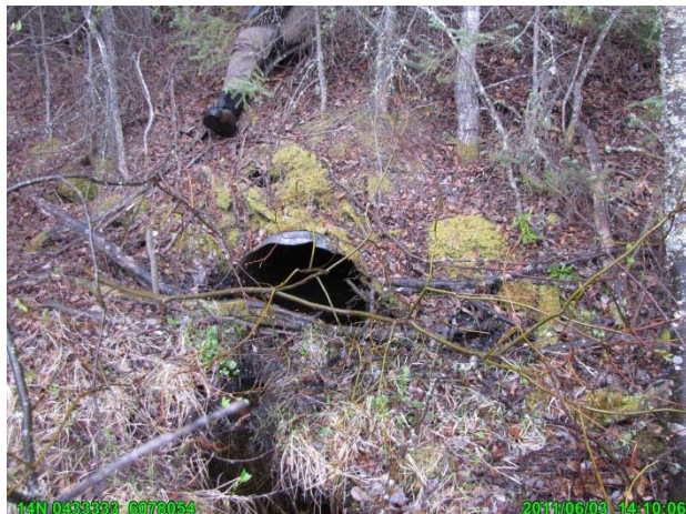
Photograph 25 ↑

RB10: Overgrown culvert on the north side of the rail bed