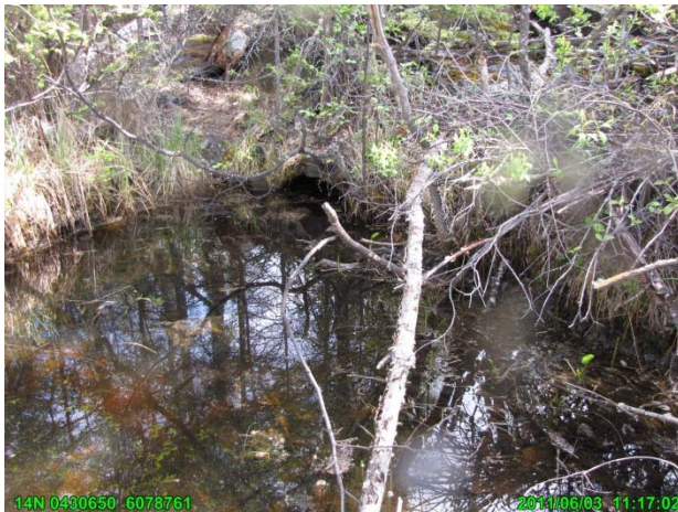
Photograph 07 ↑

RB04: Stream running parallel to the rail bed along the north side