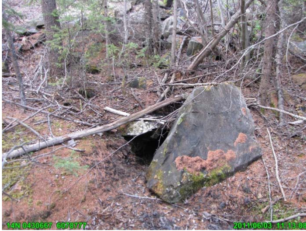
Photograph 05 ↑

RB04: Overgrown culvert on the north side of the rail bed